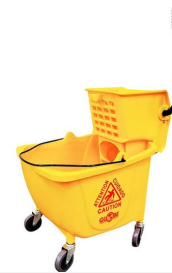
YELLOW SIDEPRESS BUCKET AND WRINGER 33L