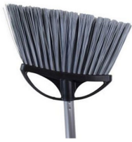
LARGE ANGLE BROOM 12" WITH 48" METAL HANDLE