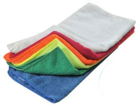
MICROFIBER CLOTH 14"X14"

Codes: 2905148 (blue)/ 2905152(red)/ 2905153 (yellow) Quantity: 10/pack