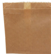
BROWN WAXED PAPER BAG FOR SANITARY NAPKIN 7,5"X0,1"X10"