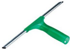
PLASTIC WINDOW SQUEEGEE 12"