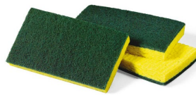
YELLOW/GREEN MEDIUM DUTY SCRUB SPONGE 3.5"X 6"

Codes: 2905148 (blue)/ 2905152(red)/ 2905153 (yellow) Quantity: 10/pack