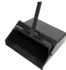
DUST PAN WITH BLACK HANDLE 12.75"X11.25"X41"