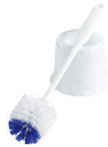
TOILET BRUSH 16" WITH BRUSH HOLDER