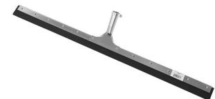
BLACK RUBBER FLOOR SQUEEGEE 18"