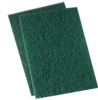
GREEN SCOURING PAD 6"X9"