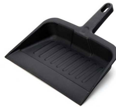
BLACK PLASTIC DUST PAN 12"