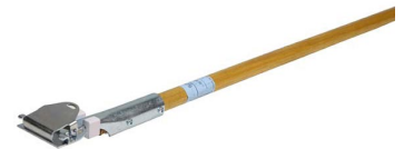
WOODEN HANDLE FOR MOP 60"