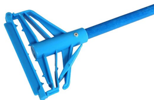
BLUE FIBERGLASS MOP HANDLE 60"

Codes: 9701139 (white)/ 9701140 (blue) Quantity: Unit