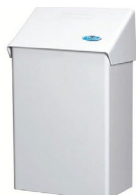
WALL UNIT FOR SANITARY TOWEL DISPOSAL