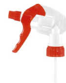
WHITE/RED TRIGGER SPRAY 8.25"