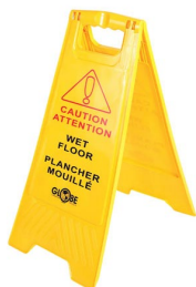
YELLOW FOLDING SIGN 25" "WET FLOOR" BILINGUAL