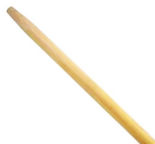
TAPERED WOODEN HANDLE 54"