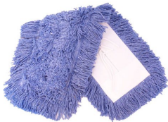
SPARE ANTISTATIC BLUE MOP 5"X24"